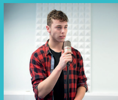
Page 4 - 5 Performing Arts a go go!