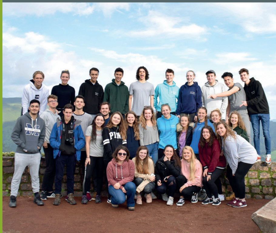
Geographers discover the Azores, situated in the most westerly part of Europe

On 9th February, 29 Geography students and 3 staff members, set off for a field trip to the Azores, an archipelago of nine volcanic islands situated in the North Atlantic Ocean about 850 miles west of continental Portugal.