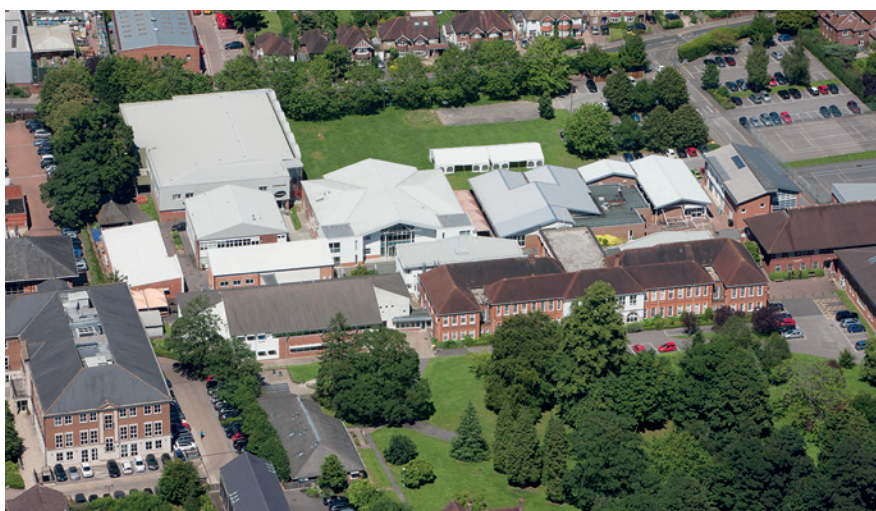
Reigate College's facilities are second to none