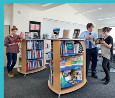
Page 3 Aspire University Pathway