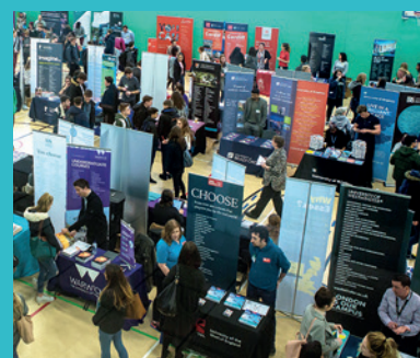
Page 8 Get Ahead Day