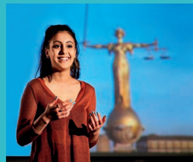
Page 8 Mixing A Levels with BTECs