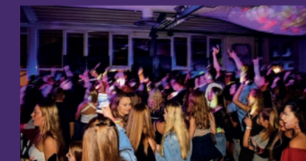
Freshers' Party