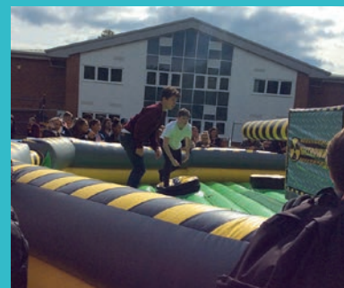
Page 5 Community Afternoon