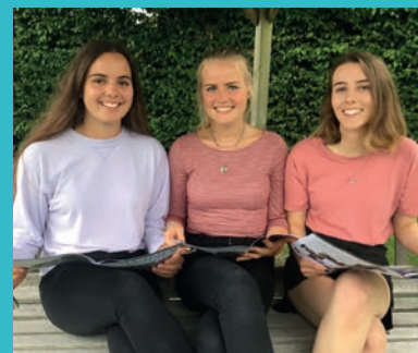
Page 3 Results Roundup 2017