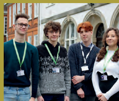
Page 3 University offers