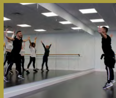
Page 6 Performing Arts roundup