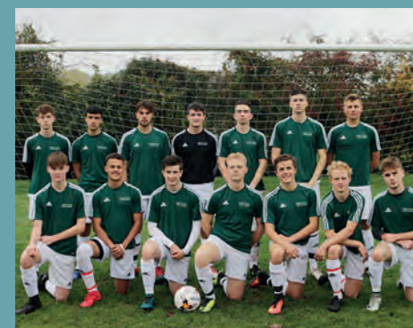
Men's 1st Football Team