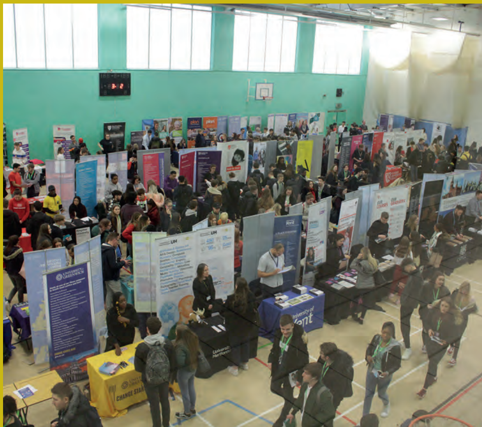
Get Ahead Day in February

It's been a busy term for the Careers Department.