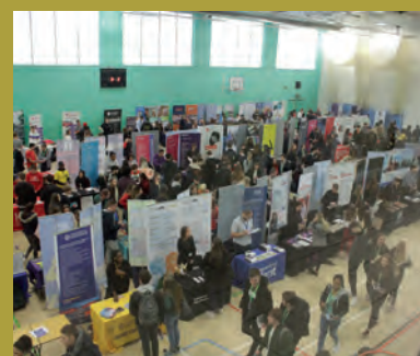
Page 4 Careers news