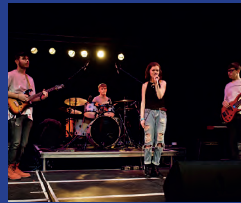
Hourglass, winner of Battle of the Bands 2019