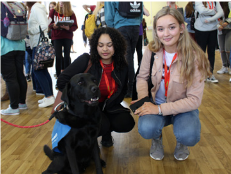
Students enjoy meeting representatives from the Guide Dogs at the Wellbeing Fair

Mentoring The College runs a student mentoring programme offering peer-to-peer support for anyone wanting some regular help or guidance getting settled into College. Students can also sign up for one-on-one sessions with the College Wellbeing Mentor (via the Personal Information Portal (PIP)) or be referred to an external Counselling Service.