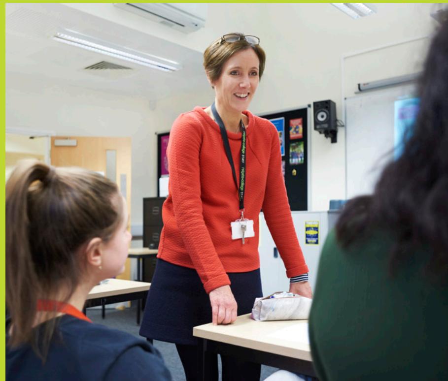
Students now join a tutor group in their Upper Sixth that better matches their post-College plans

Following the enormous success of the MVD Society in helping students secure offers for Medicine, Veterinary Science and Dentistry courses, all students now choose an Upper Sixth tutorial pathway to support them in their planning for what they wish to do after College. Students make this choice after receiving advice on the most appropriate pathway for them on Progression Day in June in the Lower Sixth.