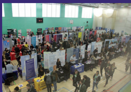
Get Ahead Day 2019