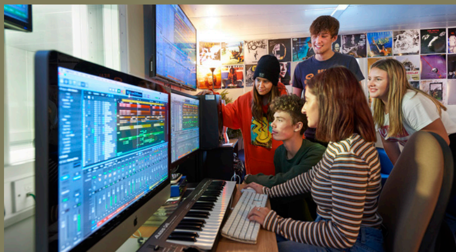
Some of the students from the 2019 Music Summer School

Reigate College's first-ever Music Summer School (aka New Music Academy) was held in July giving budding song-writers, performers and producers in Year 11 the chance to develop skills and confidence, make use of the College's impressive studio facilities in the Holmesdale Music Centre, and record their own collaborative album.