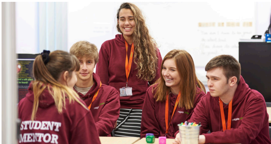
Student Mentors meet in the new Mentoring Room (R1)