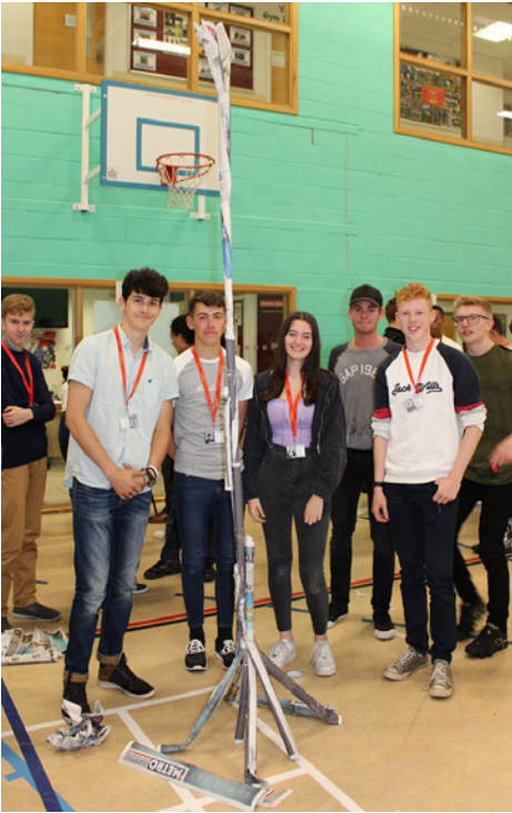
Above: Making the tallest tower challenge on Community Afternoon