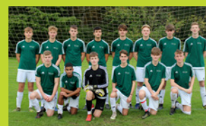
Clockwise from top left: Women's Football Team, Men's 2nd Team Football, Women's Rugby Team, Men's 1st Team Football