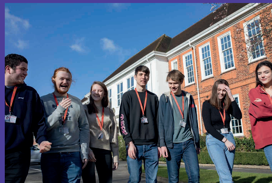
The above students are among the many receiving offers from Russell Group universities

University offers have been streaming in for Upper Sixth students this term, including those on the College's Aspire Programme.