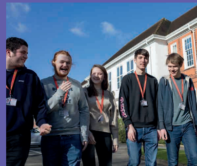
Page 3 Top offers