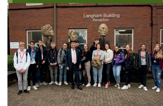
David Dein with some of the College's A Level PE students

Reigate College was delighted to welcome former Vice-Chairman of Arsenal and the Football Association, David Dein MBE into College, to speak to A Level PE students about "The Commercial Side of Football and the Phenomenal Success of the Premier League."