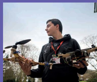
Page 5 Extended Project Qualifications