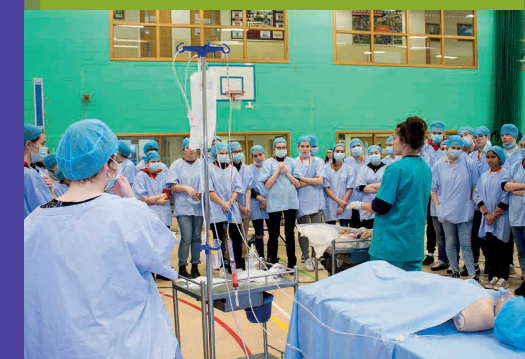
Operating Theatre Live

Students on the MVD pathway who are looking to study Medicine, Veterinary Science or Dentistry at university have had a busy term, with a number of external speakers coming into College to talk about their specialisms, including: