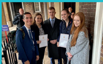
Students with their awards at St James's Palace

Congratulations to the 48 students who've completed the Duke of Edinburgh's Gold Award since enrolling in September 2018. This spring 19 students, past and present, will be going to Buckingham Palace to receive their award.