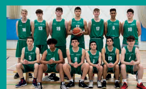
Clockwise from top left: Men's Hockey Team, Women's Football Team, Netball Teams A & B, Basketball Team