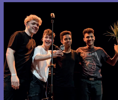
Page 8 Battle of the Bands