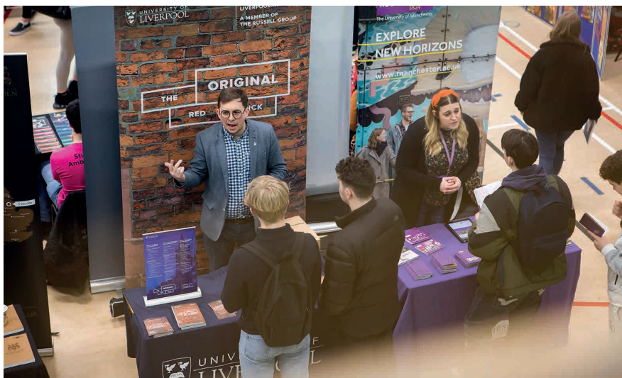
116 exhibitors took part in Reigate College's annual Get Ahead Day in February