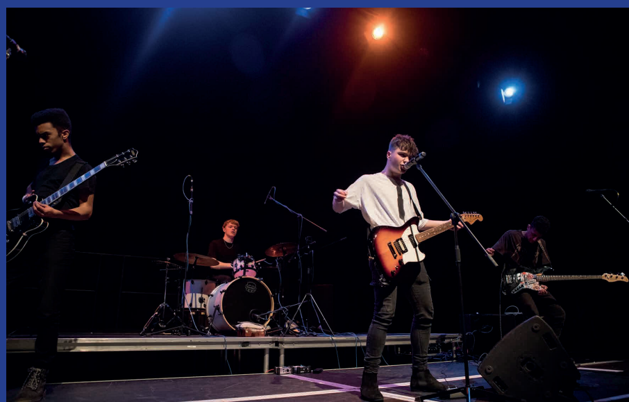
Above: Days Notice. Below: Hourglass