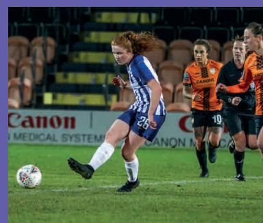
Page 10 Meet Football star Libby Bance