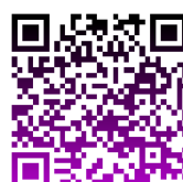
Tariff Point Calculator