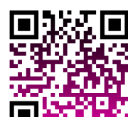
SACU Careers Quiz