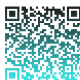
Prospects- What can I do with my degree?